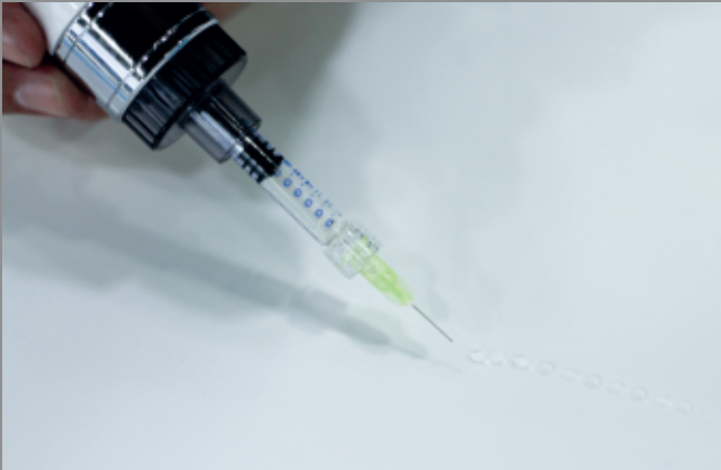
Application of high viscosity non-reticulated hyaluronic acid (3.5%) with a 34G microneedle (PASNY)

DermaJet is an advanced injection device that can deliver precise doses , adapted to each treatment, ensuring optimum results and product usage.