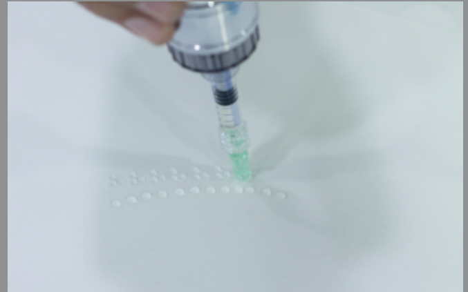
Application of high viscosity non-reticulated hyaluronic acid (3.5%) with a 34G triple-tip microneedle (PASKIN)