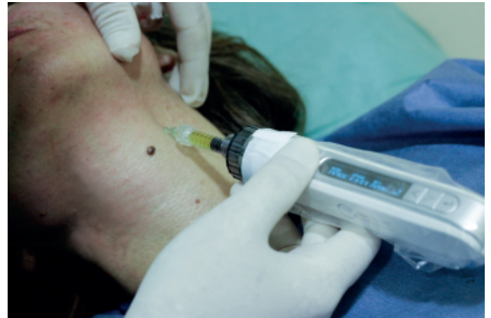
Application of PRP with Dermajet and Pasny 34G needles.